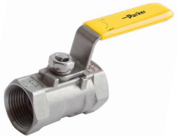
Model Shown: 16F-DY16L-T-SS